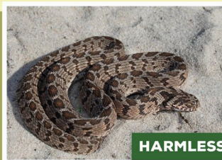
Common Egg-eater ( Dasypeltis scabra )