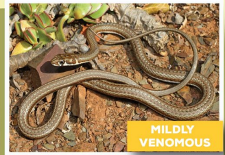
Karoo Sand Snake ( Psammophis notostictus )