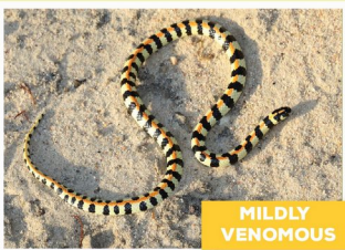
Spotted Harlequin Snake ( Homoroselaps lacteus )