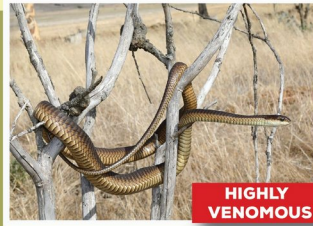
Boomslang - female ( Dispholidus typus )