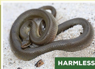
Brown Water Snake ( Lycodonomorphus rufulus )