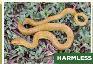
Aurora House Snake ( Lamprophis aurora )