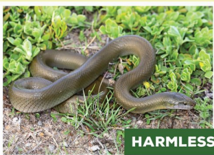
Olive Snake ( Lycodonomorphus inornatus )