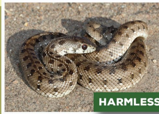
Mole Snake - juvenile ( Pseudaspis cana )