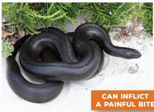
Mole Snake - adult ( Pseudaspis cana )